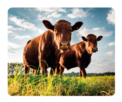
Pastoral farming is rearing animals, such as cows and sheep.

Arable farming is growing crops, such as cereals and vegetables.