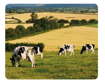
Mixed farming is both growing crops and rearing animals.

The type of farming depends on the climate, the quality of the soil and the topography of the area. For example, the flat, nutrient-rich land in the east of England is perfect for arable farming, whereas the wet and windy hills of central Wales are most suited to pastoral sheep farming.