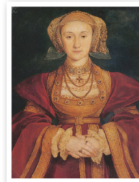
Anne of Cleves by Hans Holbein

Holbein was a German artist and portrait painter. He travelled to England in 1532 with the backing of Anne Boleyn and Thomas Cromwell. In 1535, he became the King's Painter. Holbein painted many portraits of the royal family and the nobles. He was also asked to paint a picture of Anne of Cleves so Henry could decide if he wanted to marry her. Henry liked the portrait but the marriage only lasted six months because Anne didn't look as beautiful in real life as she did in her portrait.